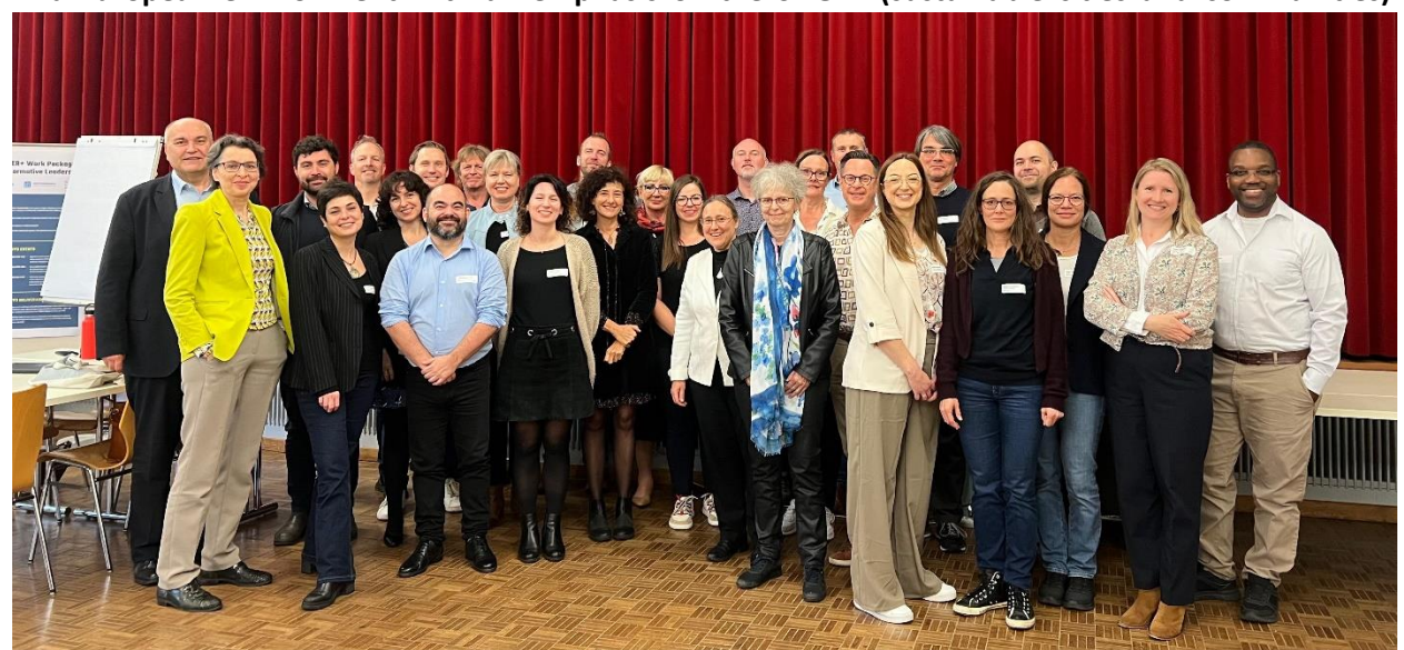
"Our vision is to grow together", the PIONEER partners state.

The PIONEER Alliance brings together 10 impact-driven universities, over 130,000 students and 17,000 faculty and staff across Europe. The PIONEER Alliance is shaped around our shared expertise in cities and ecosystem co-creation. The members of the Alliance will focus on sustainable development and urban planning issues in the project during 2025-2028. The PIONEER Alliance aims to shape the future of inclusive, safe, resilient, and sustainable cities providing students and lifelong learners dedicated skills in a European environment with an emphasis on the SDG11 (sustainable cities and communities).